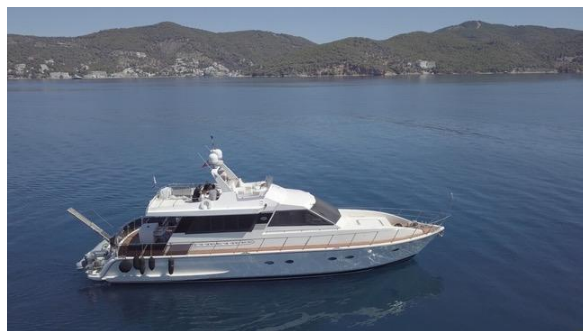
Starboard Side aerial view