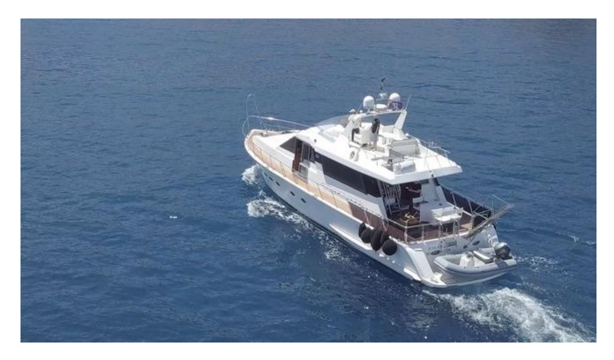
Aerial stern view while underway Side profile while cruising