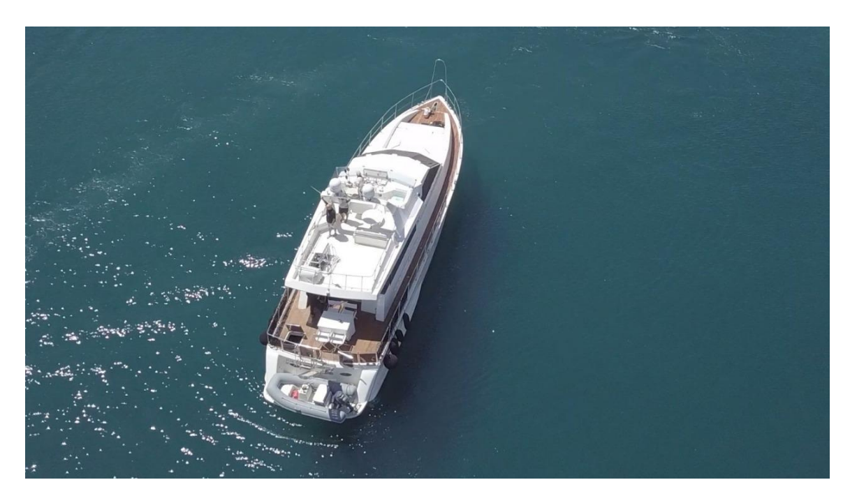
Panoramic view of M/Y Joker prior to her luxury cruise departure