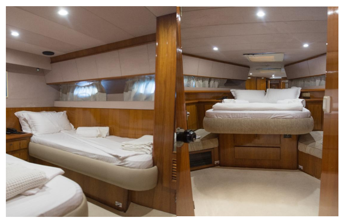
Twin guest cabin