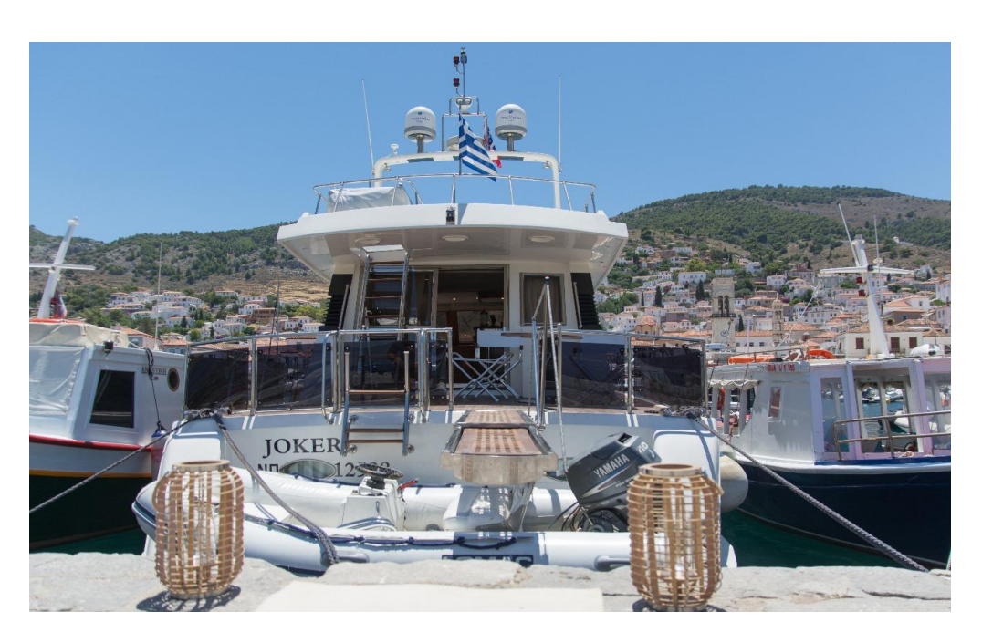
Stern view at port - "JOKER" with tender